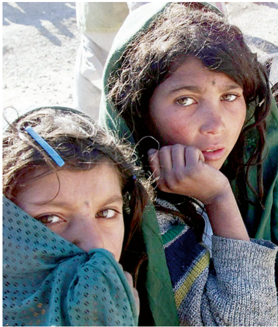
▲ Two Afghan girls quietly wait for food at a refugee camp on the Afghanistan-Iran border.